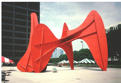
La Grand Vitesse , Alexander Calder, Grand Rapids, MI, 1969.