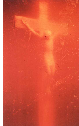
Ajito 1981, Robert Mapplethorpe